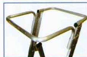
SAFETY GATE OPTIONAL EXTRA