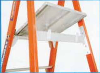
STRONGEST PLATFORM STRUCTURE