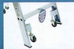
CASTORS FITTED OPTIONAL EXTRA C/W "STRONGBOW" WORLD'S STRONGEST BASE BRACE TREAD STIFFENER