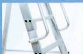
INTEGRATED HANDRAIL CONNECTOR