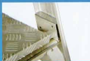
FULLY SUPPORTED PLATFORM