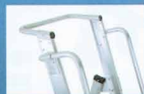
FULLY INTEGRATED EXTRUSION CONNECTION SAFETY RAIL / HAND RAIL