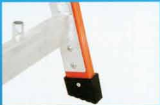
SIDE RAIL SAFETY MOUNT