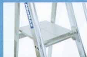
STRONGER FULLY SUPPORTED PLATFORM STRUCTURE