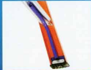
"STRONGBOW" WORLD'S STRONGEST BASE BRACE TREAD STIFFENER