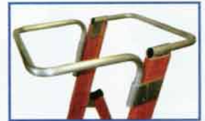
SAFETY GATE OPTIONAL EXTRA

*CASTOR MOUNTS WILL BE STANDARD ON EVERY PLATFORM STEP LADDER