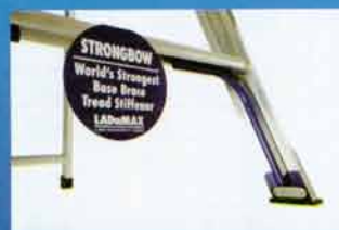
"STRONGBOW" WORLD'S STRONGEST BASE BRACE TREAD STIFFENER