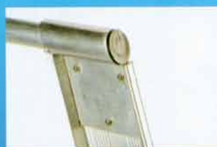
NEW STRONGER HANDRAIL GRIP