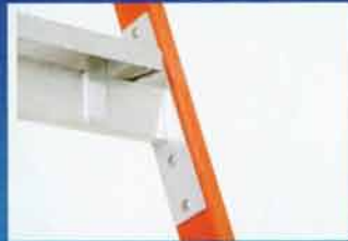
SUPERIOR RECTANGULAR HOLLOW REAR FRAME