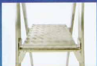
STRONGEST PLATFORM STRUCTURE